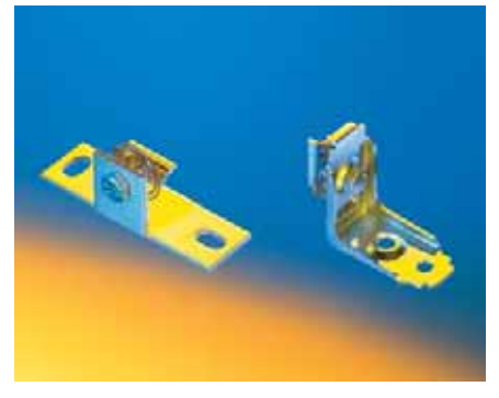
Versions for walls and floors