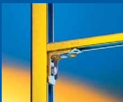
Angle connector CC 90° Stabil