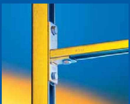
Fitting Set CC MH41