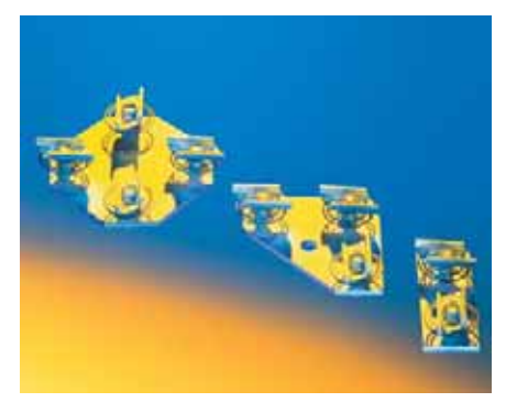
Flat Fittings CC